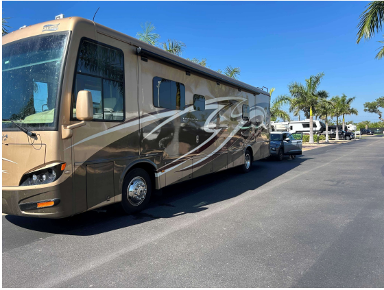
Stopping in FL.