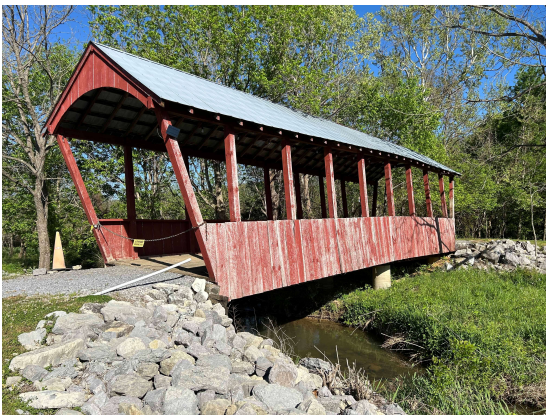
Tennessee Bridge built like their roads...

When a Minnesotan spends 2 hours on the beach in FL. You can just see my wife's arm. She was worse than me! Started peeling 2 days later... It was worth it!!